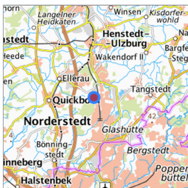
Location in the requested region