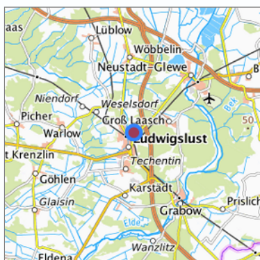
Location in the requested region