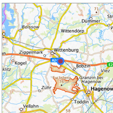
Location in the requested region