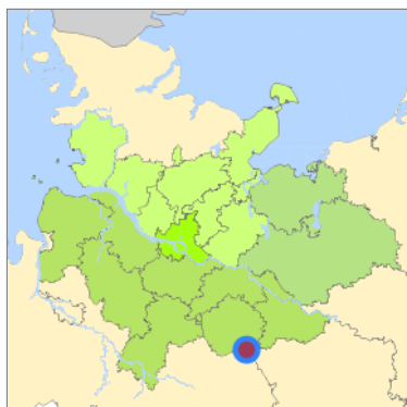
Location in the Hamburg Metropolitan Region