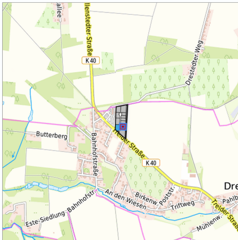
Detailed view of the requested site